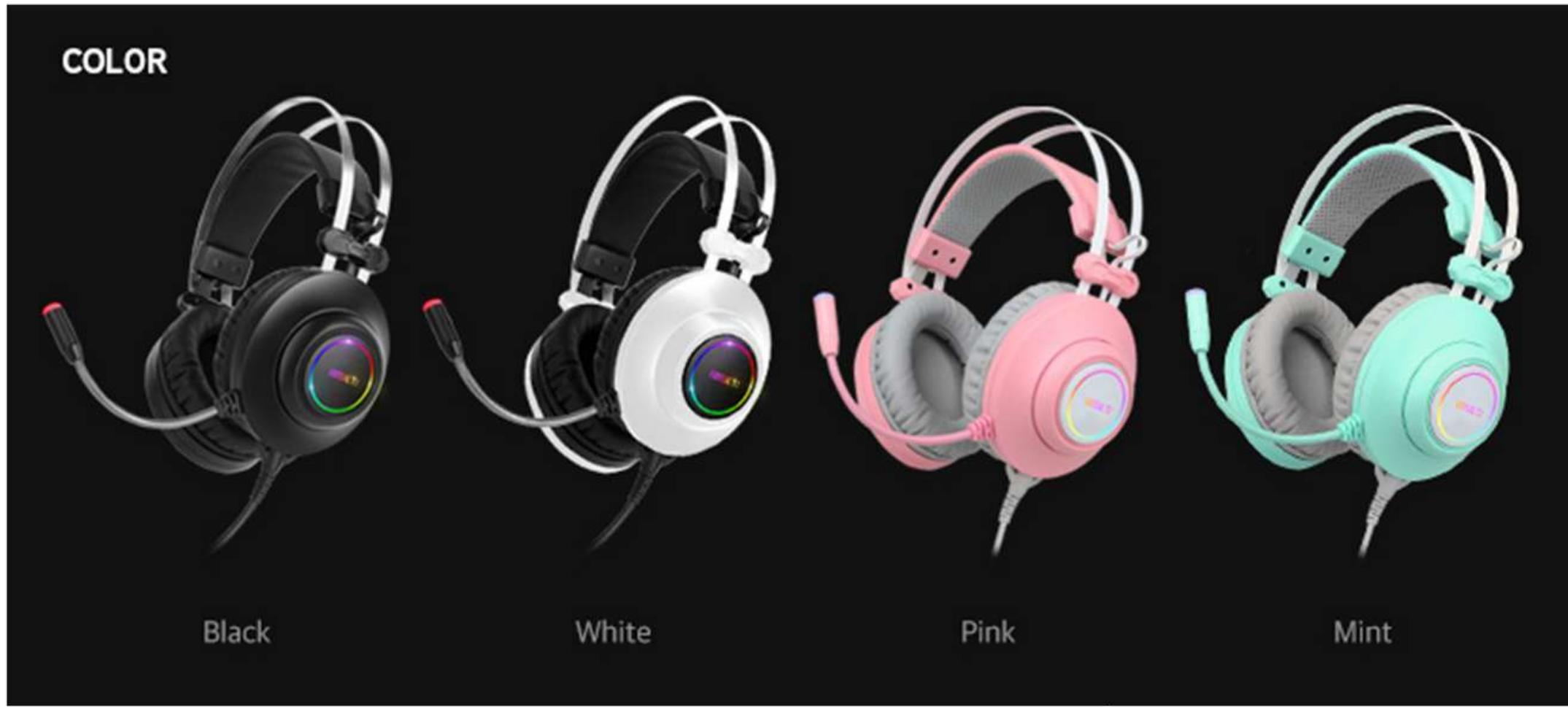
ABKO Hacker H550 7.1 40,000