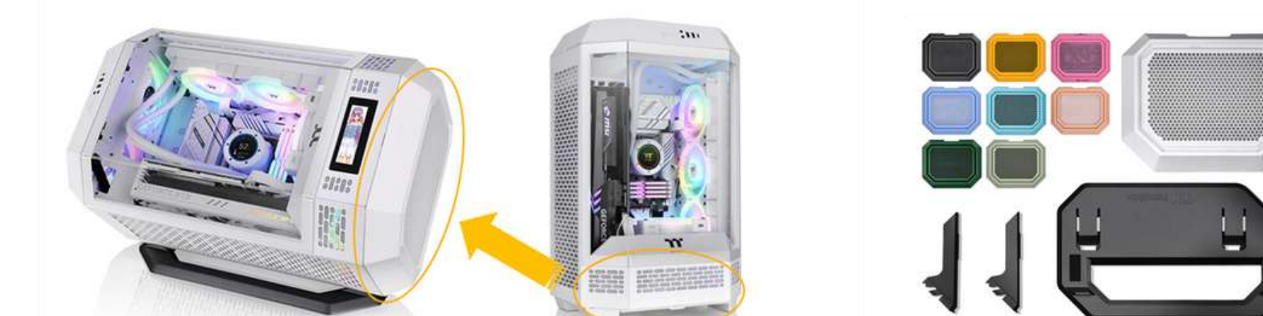
Case Stand Kit – 60,000