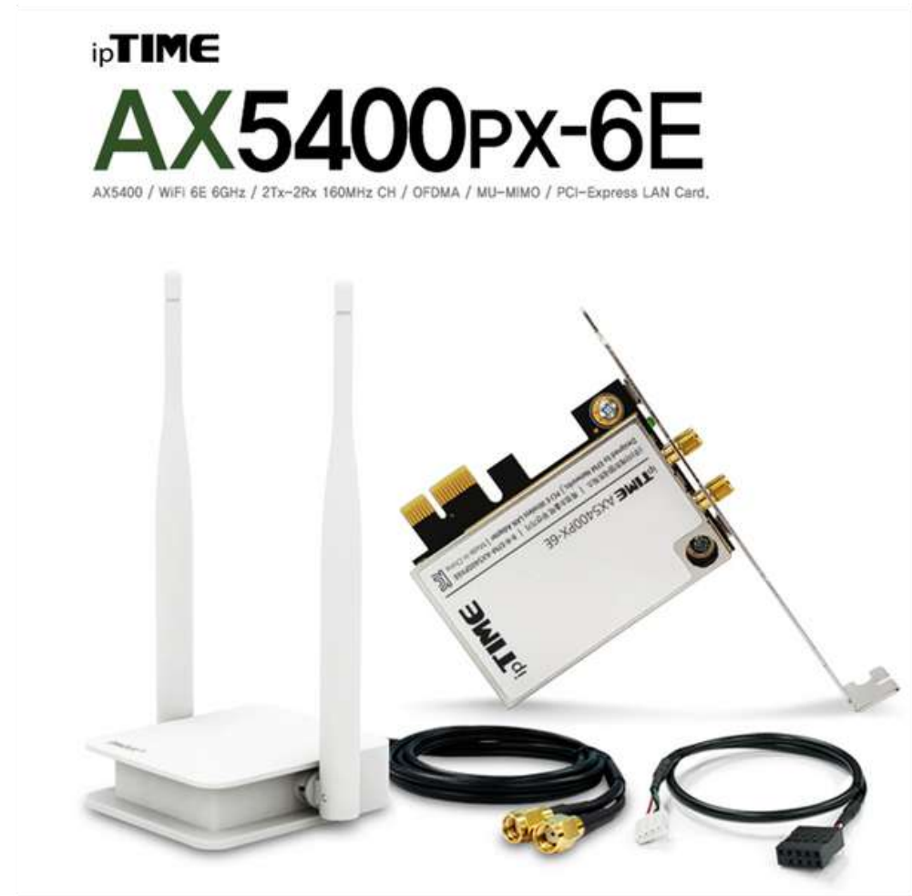
Interface: PCIE (Installed in motherboard) WIFI 6E + Bluetooth 5.2 60,000