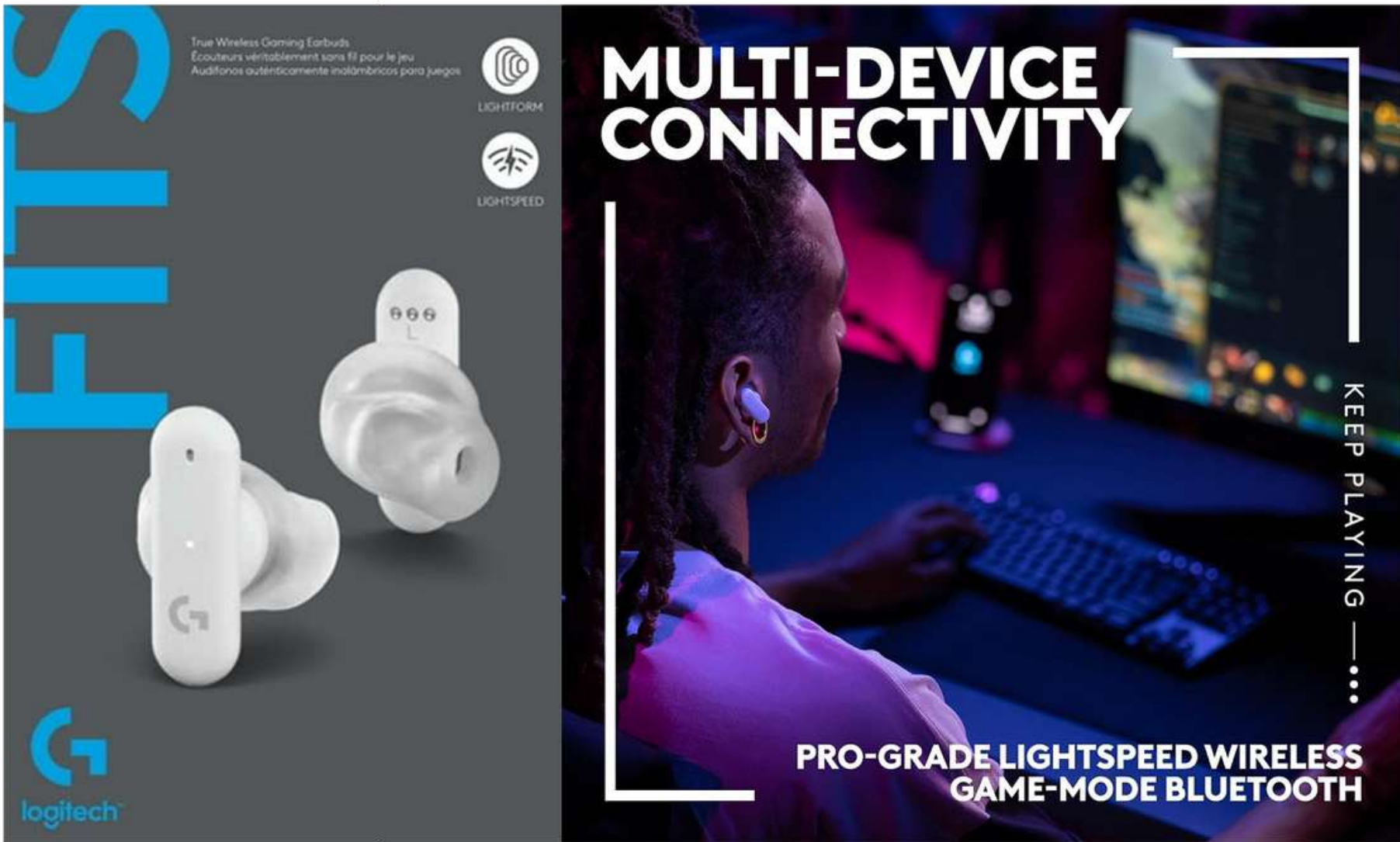
Logitech G Fits (White) Bluetooth Earbuds UV Light Molding Earbuds USA Import Model IOS/Android/Windows/Mac 195,000