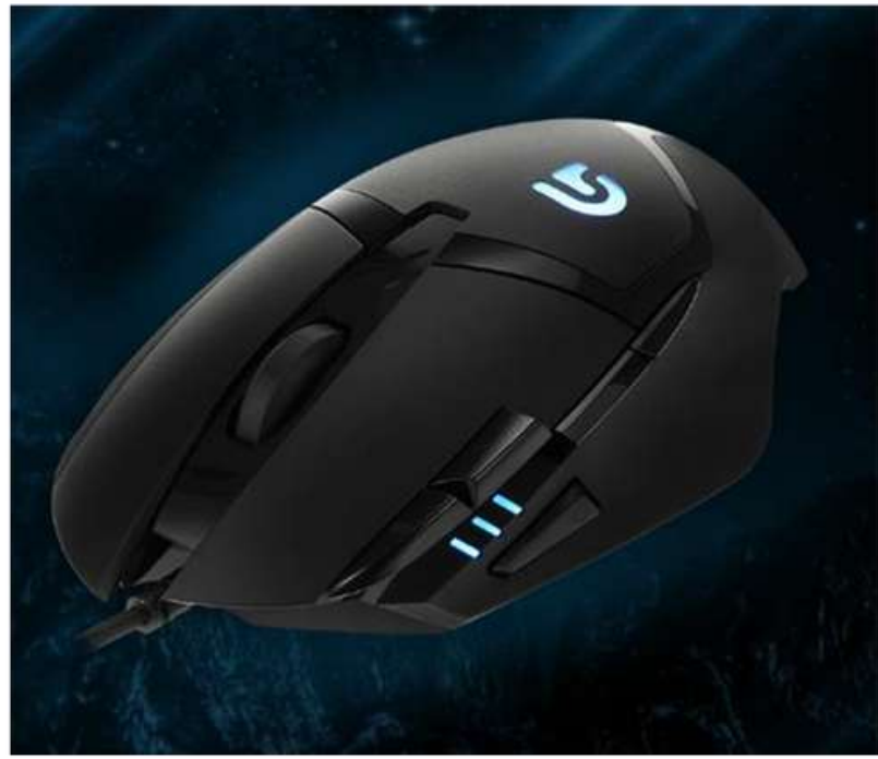
Logitech G402 60,000