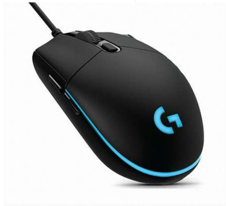
Logitech G102 25,000