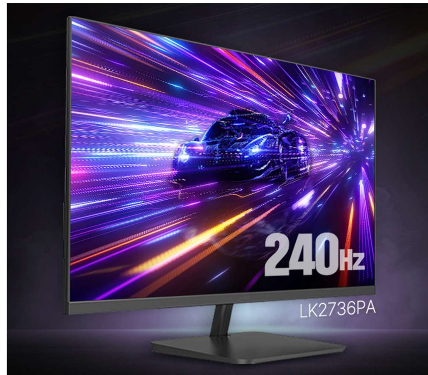
UDEA EDGE LK2736PA