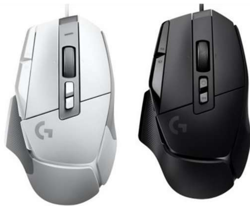
Logitech G502X (BLK/White) 99,000