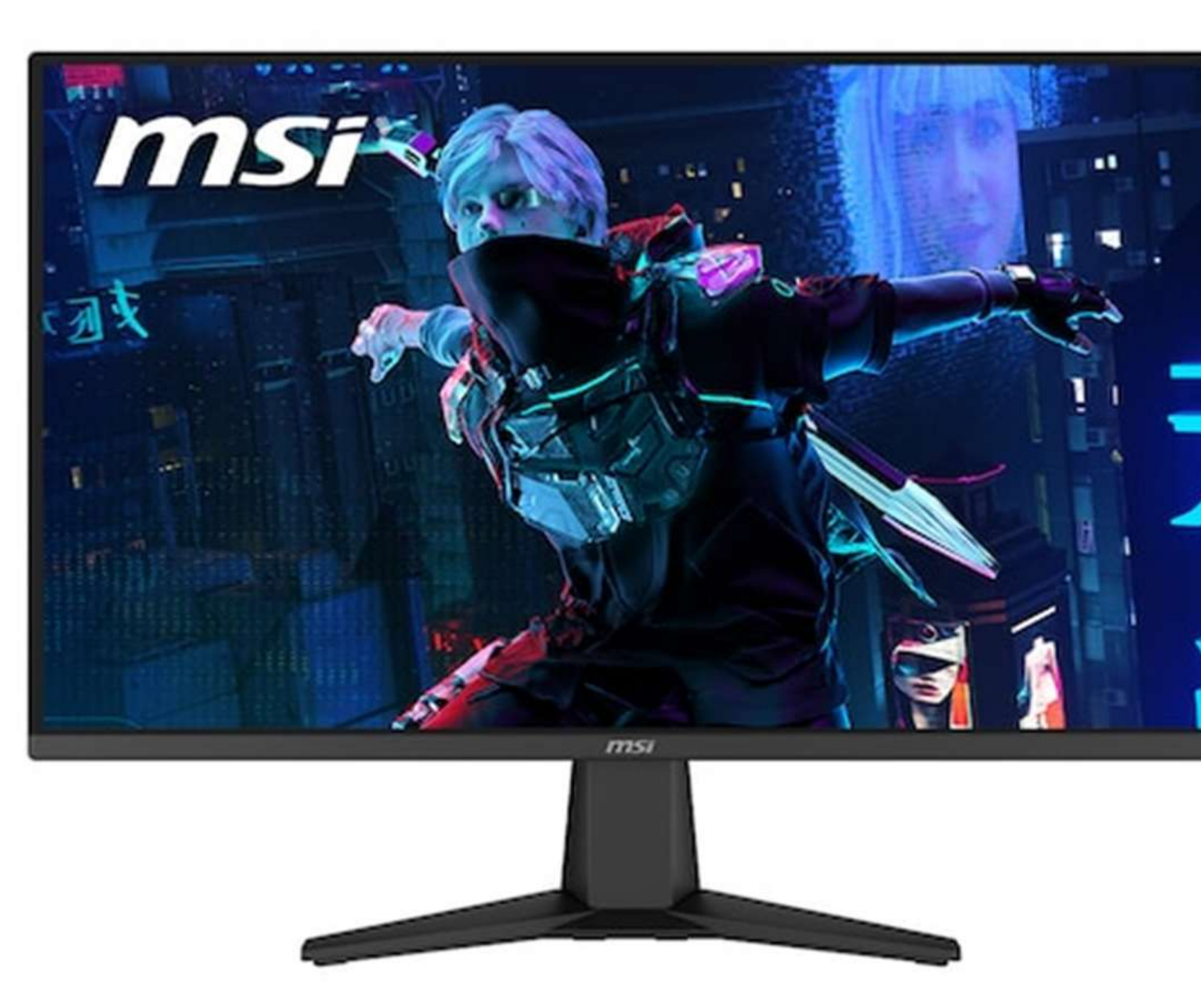
MSI MAG 275QF IPS