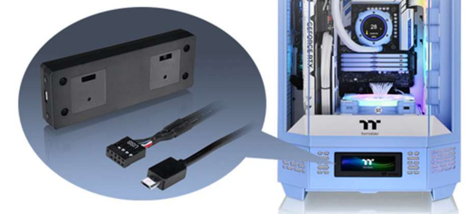
3.9" LCD Screen Kit – 150,000