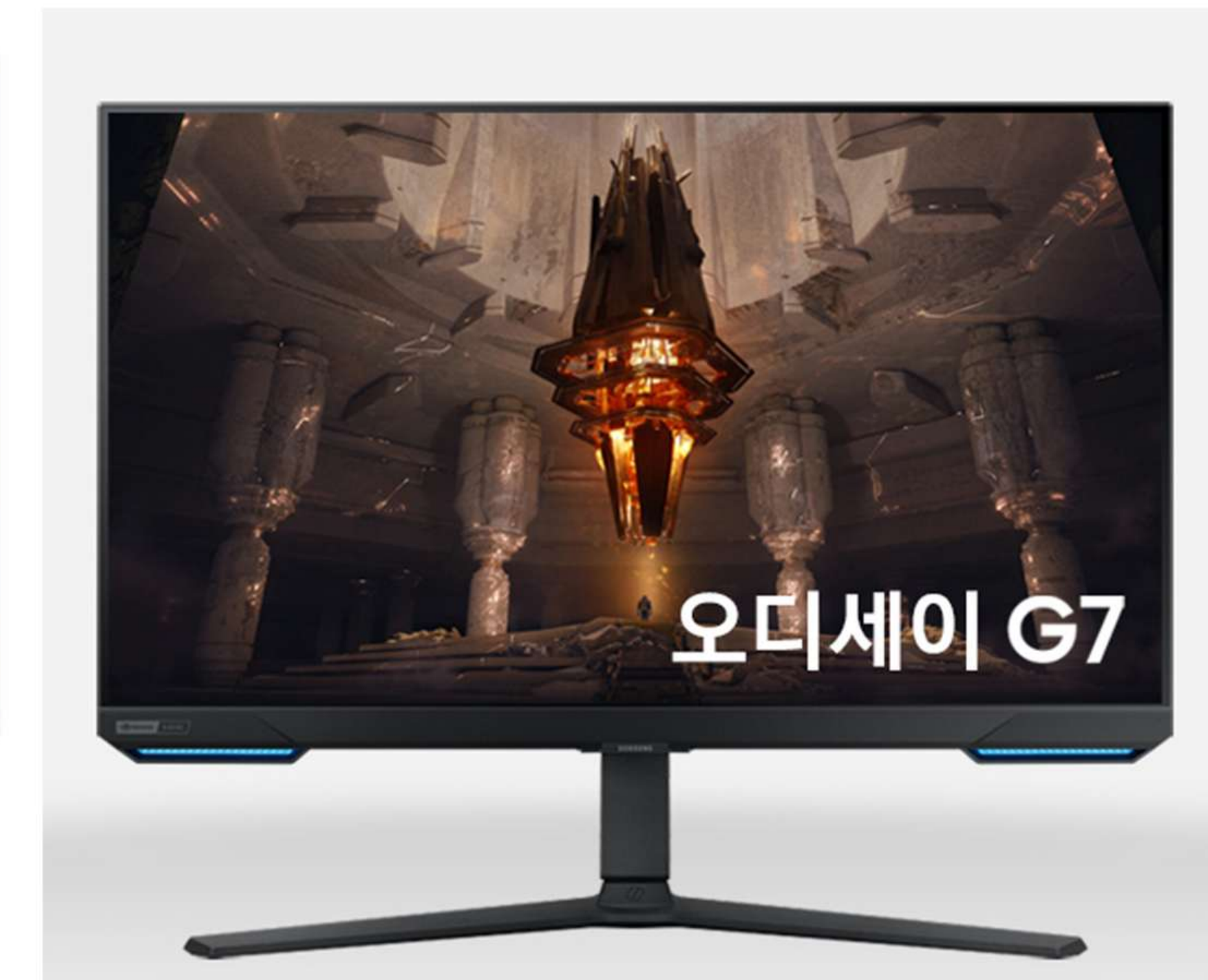
Samsung Odyssey G7S32DG700