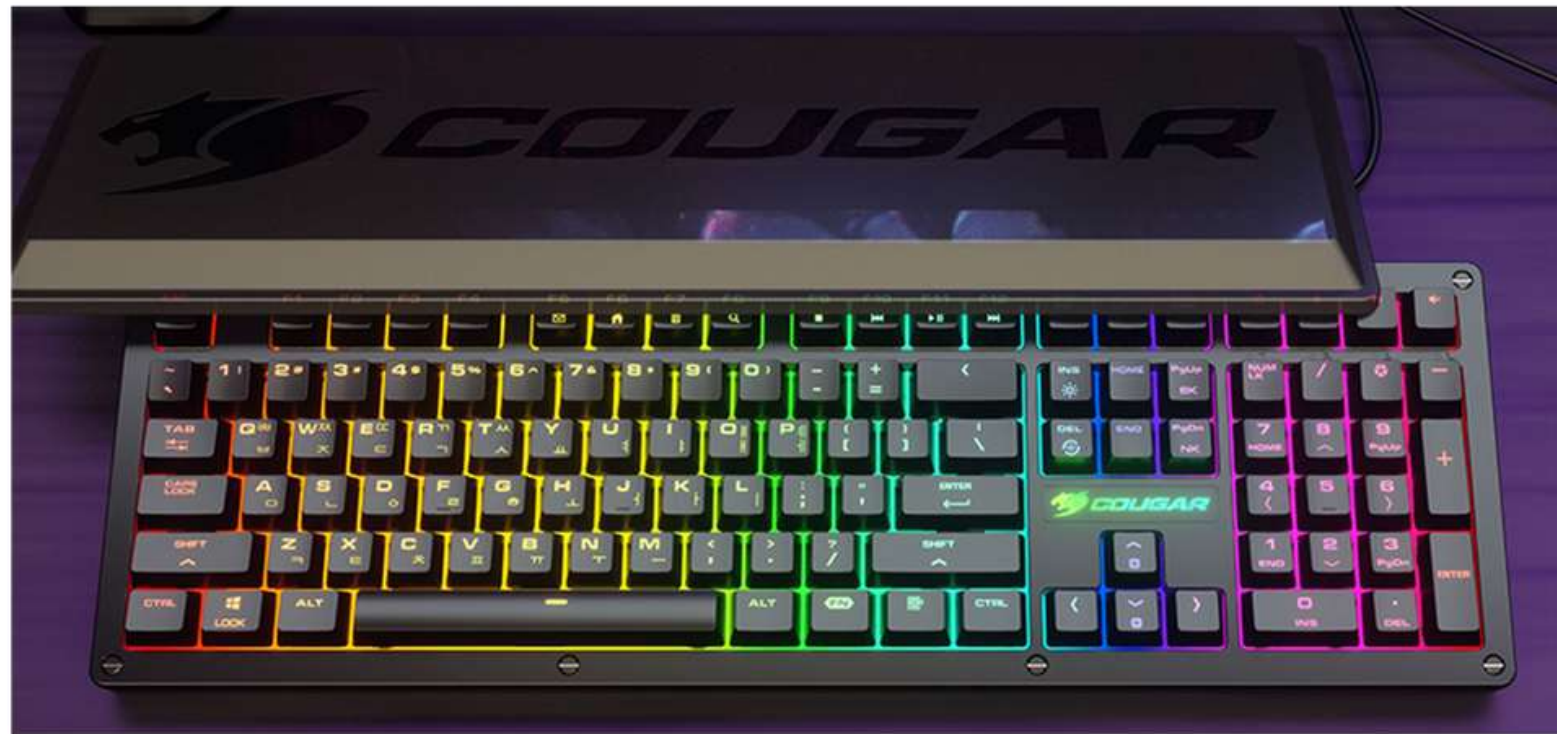
COUGAR PURI RGB Red Switch: 70,000