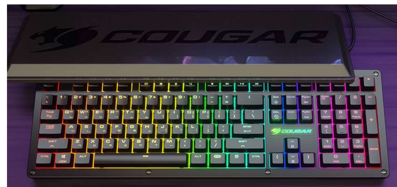
COUGAR PURI RGB Red Switch: 70,000