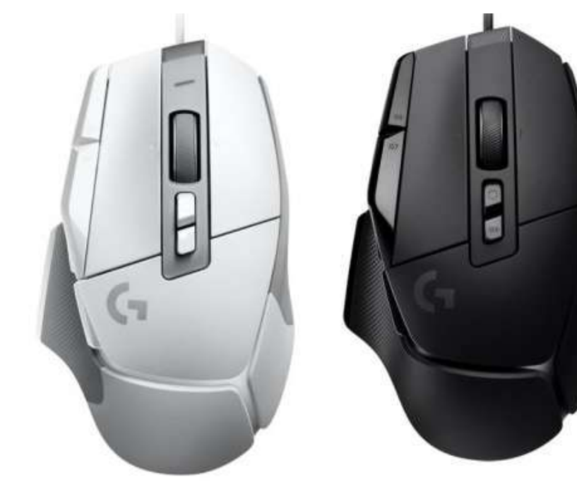
Logitech G502X (BLK/White) 99,000