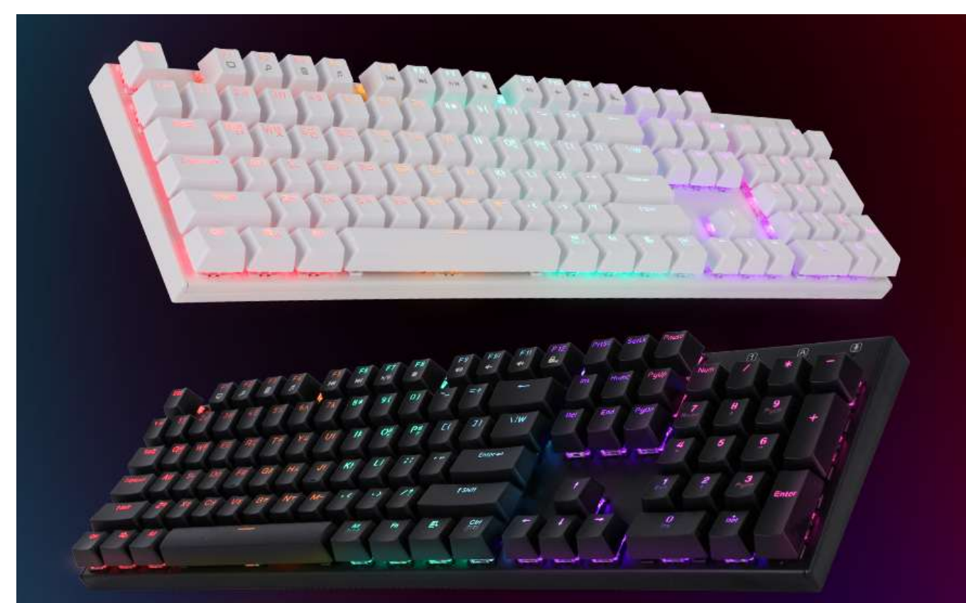
Abko K640 Mechanical Keyboard Black/White Blue/Brown/Red Switch: 45,000