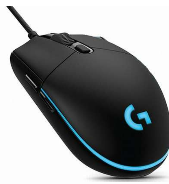
Logitech G102 25,000