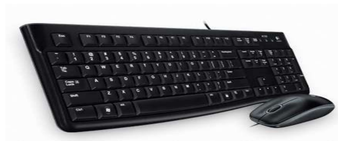
Logitech MK120: 20,000 Keyboard Only: 15,000