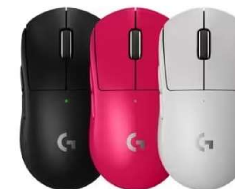
Logitech G Pro X Superlight 2 (Wireless) [Black/White] 200,000