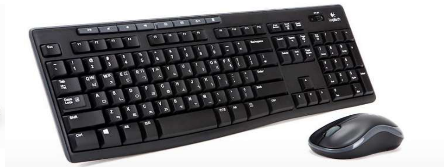
Logitech MK270r (Wireless): 40,000