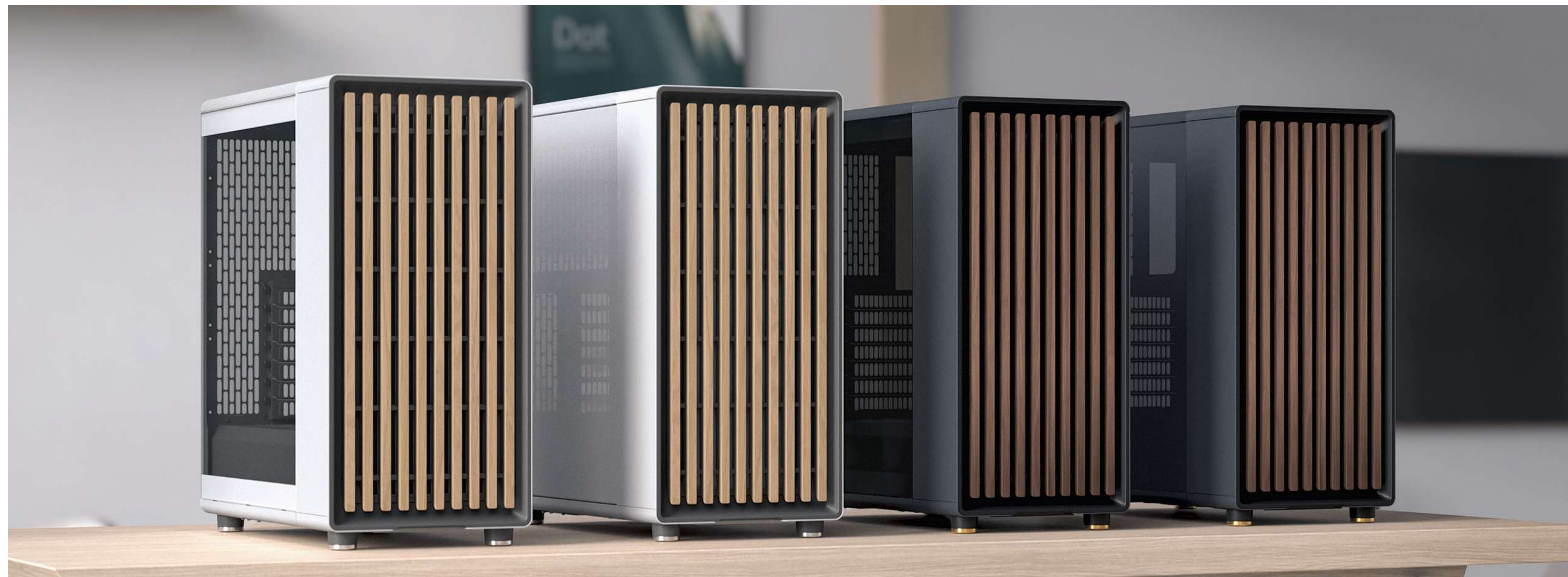
North White TG Clear Tint Tempered Glass Side Panel