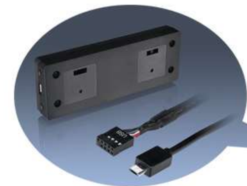
3.9" LCD Screen Kit - 150,000