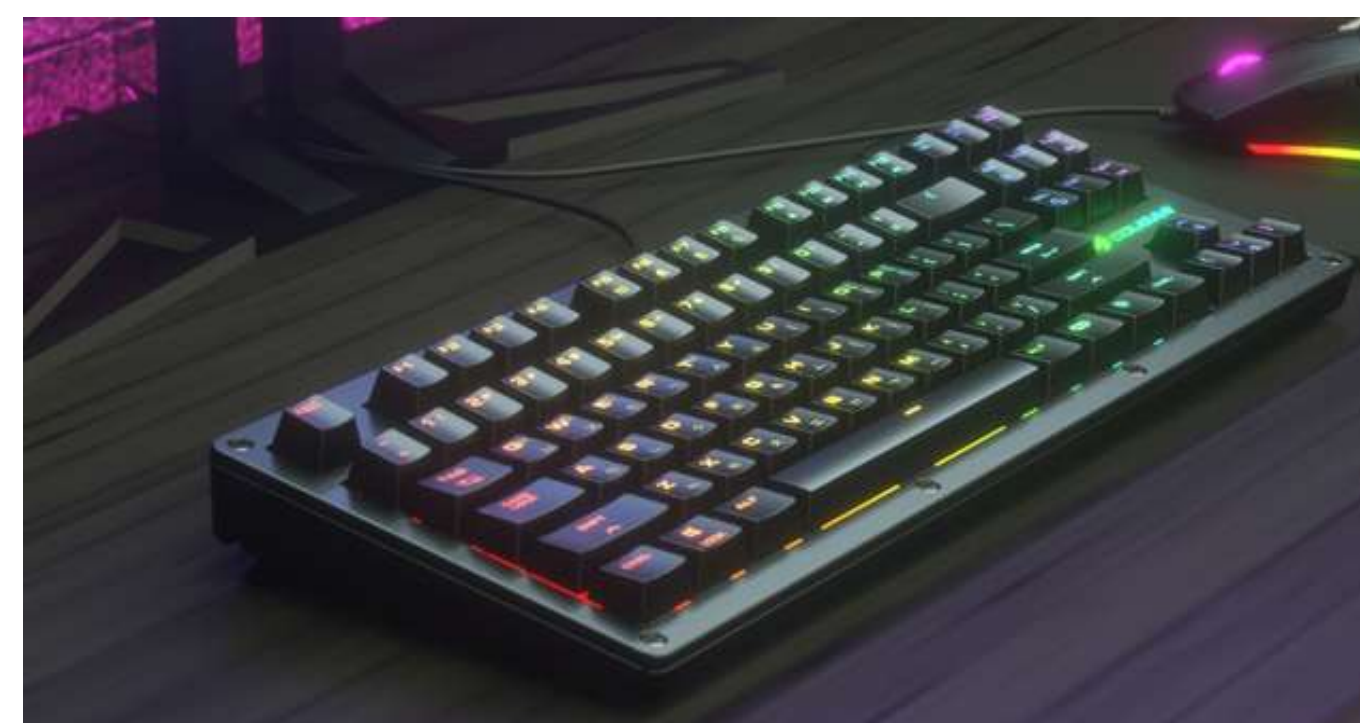
COUGAR PURI TKL RGB Red Switch: 65,000