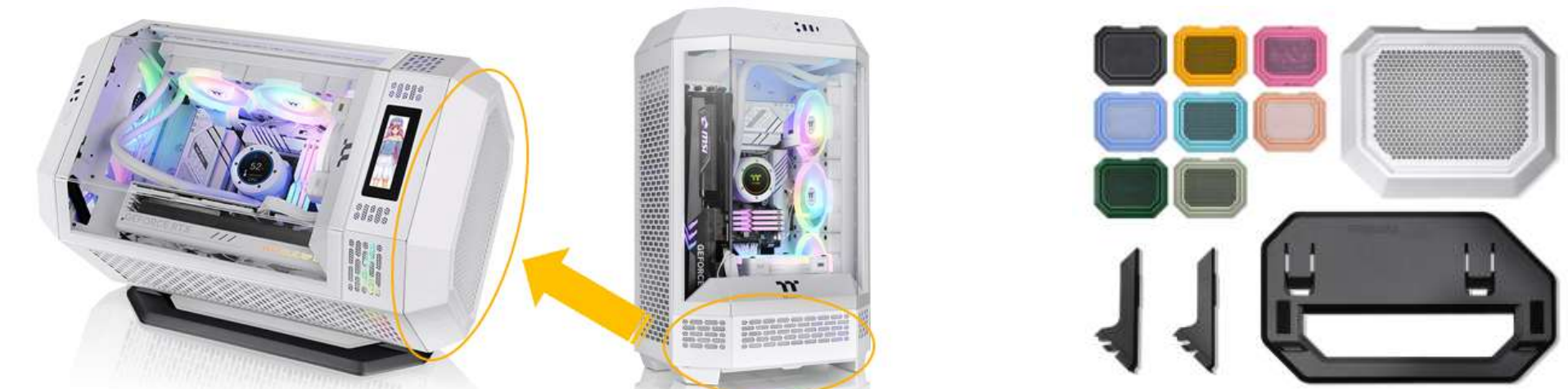
Case Stand Kit - 60,000