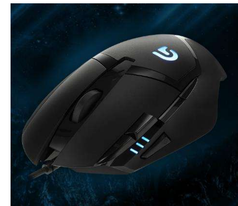
Logitech G402 60,000