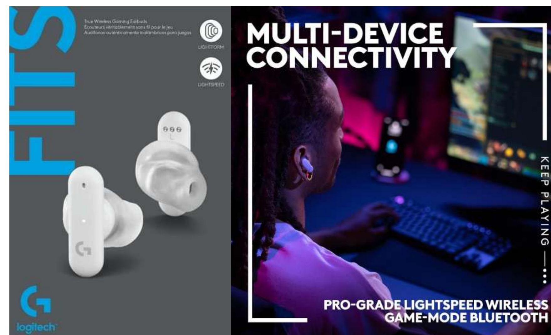
Logitech G Fits (White) Bluetooth Earbuds UV Light Molding Earbuds USA Import Model IOS/Android/Windows/Mac 195,000