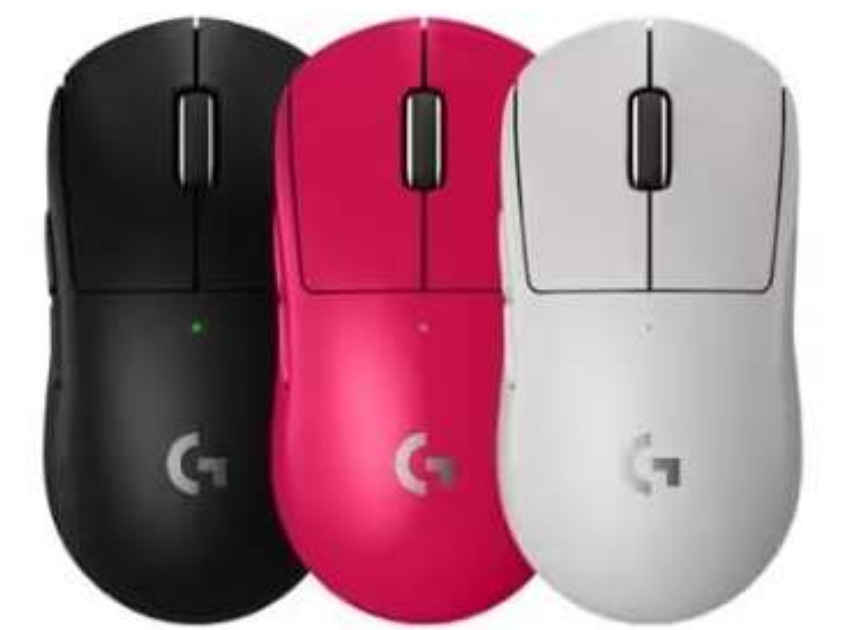
Logitech G Pro X Superlight 2 (Wireless) [Black/White] 200,000