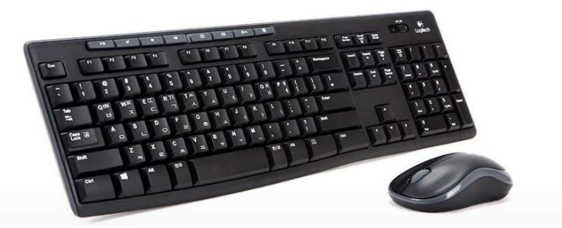
Logitech MK270r (Wireless): 40,000