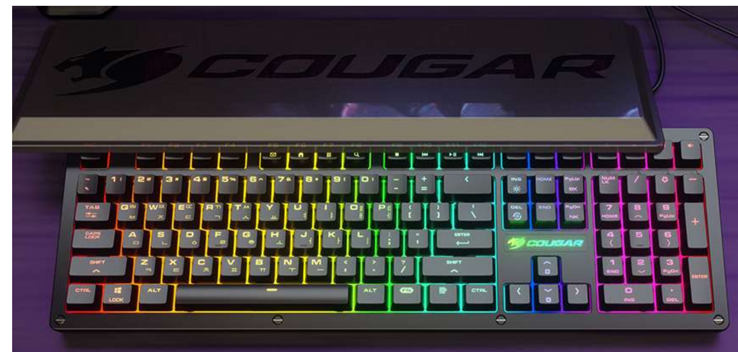
COUGAR PURI RGB Red Switch: 70,000