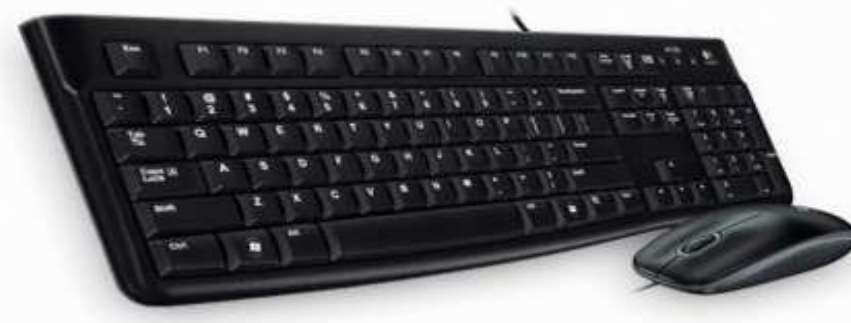
Logitech MK120: 20,000 Keyboard Only: 15,000