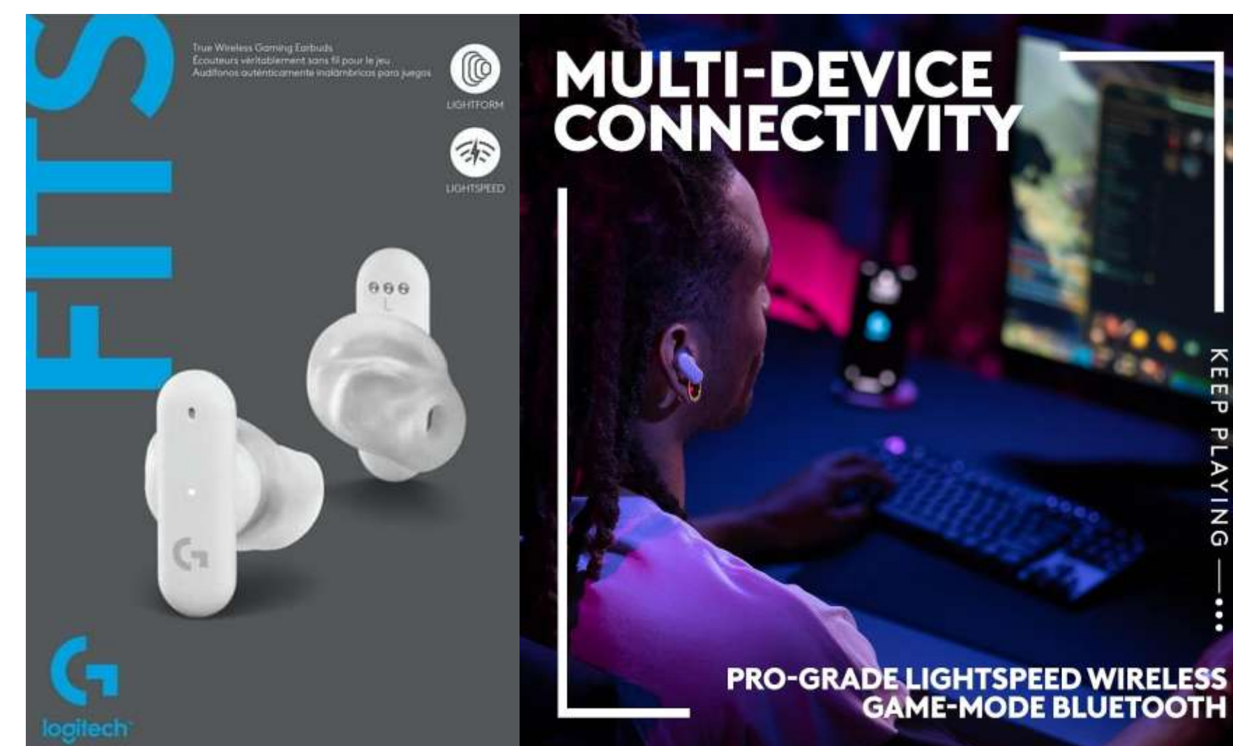
Logitech G Fits (White) Bluetooth Earbuds UV Light Molding Earbuds USA Import Model IOS/Android/Windows/Mac 195,000