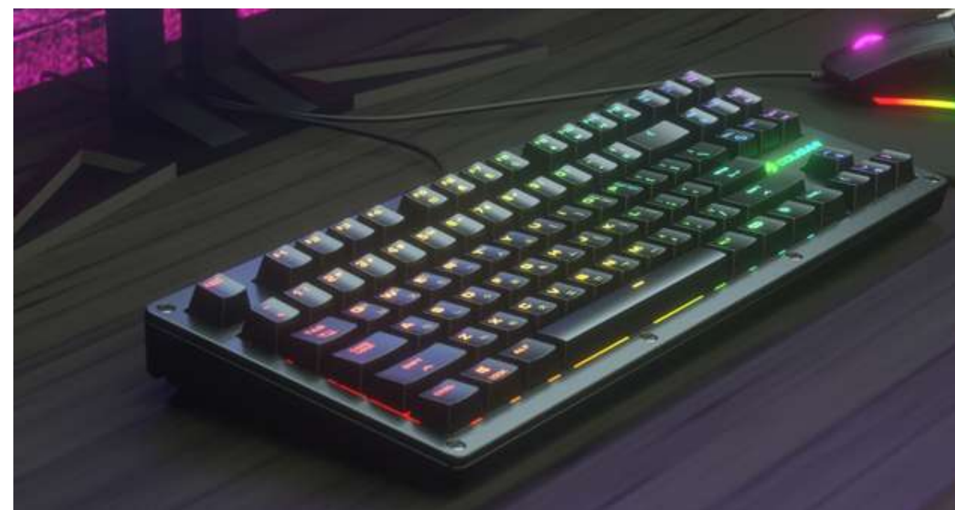
COUGAR PURI TKL RGB Red Switch: 65,000