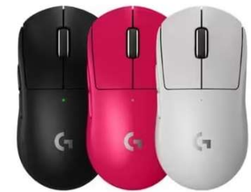
Logitech G Pro X Superlight 2 (Wireless) [Black/White] 200,000