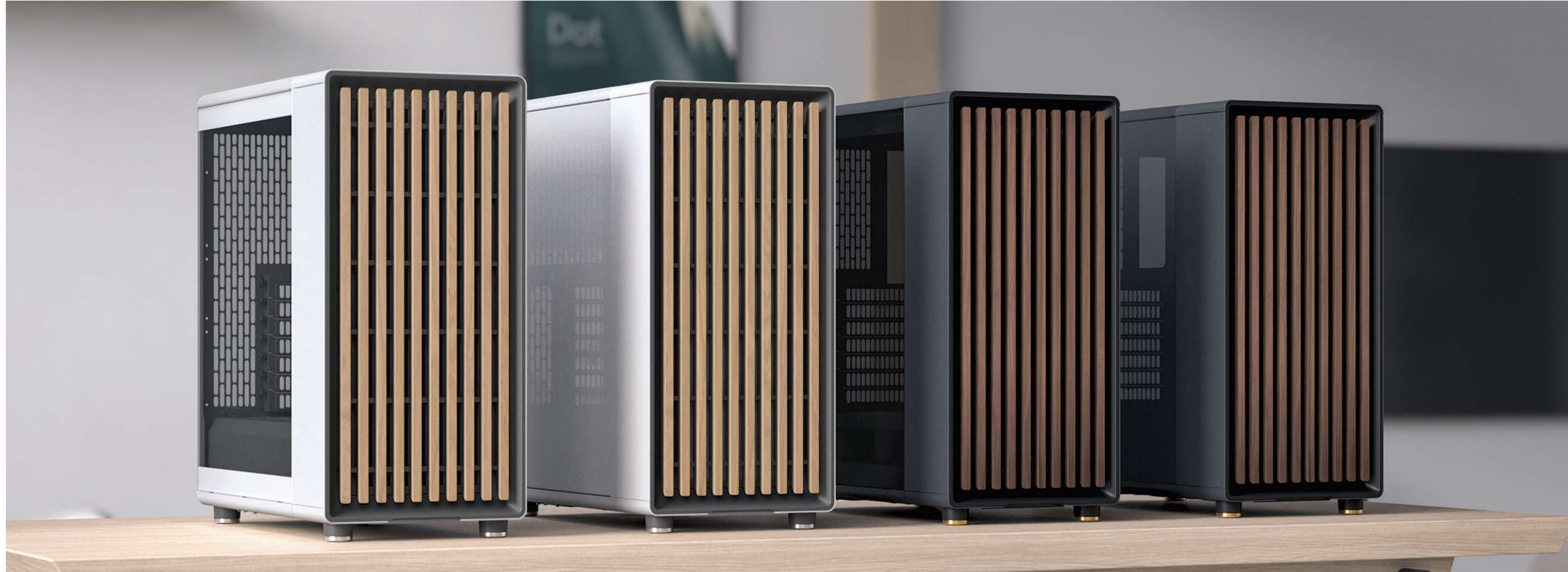
North White TG Clear Tint Tempered Glass Side Panel