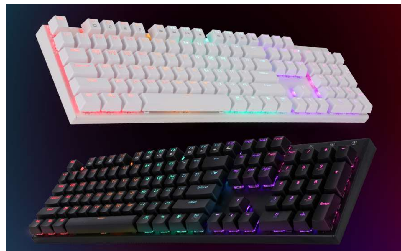
Abko K640 Mechanical Keyboard Black/White Blue/Brown/Red Switch: 45,000