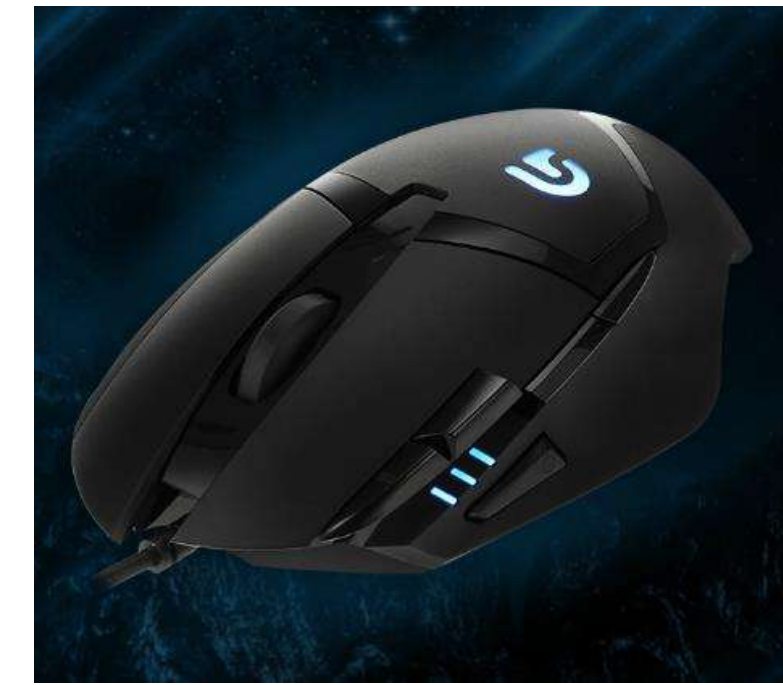
Logitech G402 60,000